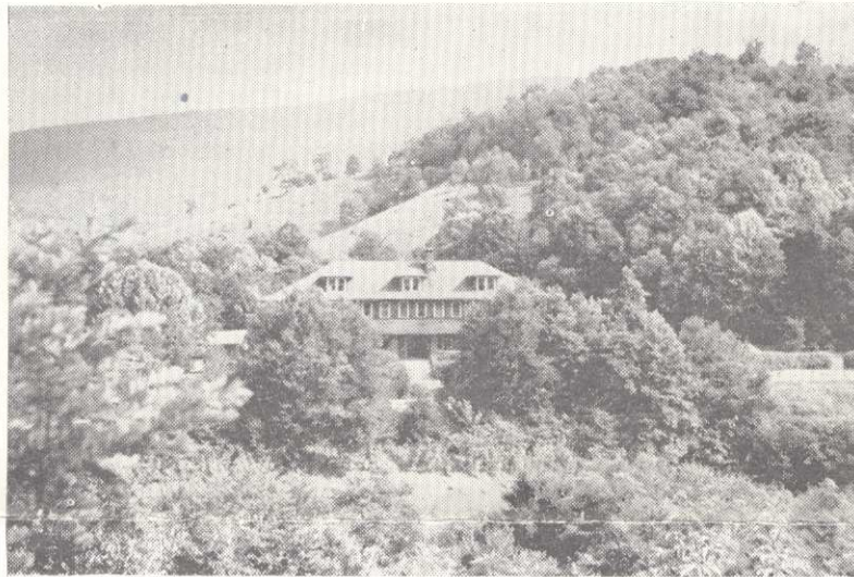
KONNAROCK TRAINING SCHOOL

It will possibly take two years to finish this gem of a church in the heart of the Southwest Virginia Mountains. It takes longer, when, instead of ordering the material ready for the building, those who build have to go into the woods, cut the timber and manufacture it, or search the valleys and mountains for just